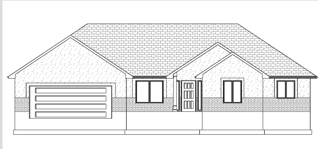
2 CAR GARAGE