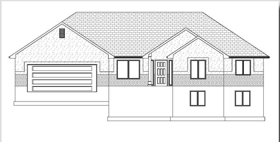
2 CAR GARAGE WITH OPTIONAL BASEMENT